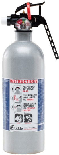
Kidde Disposable Fire Extinguisher with plastic valve