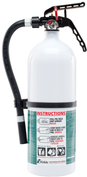
Kidde Disposable Fire Extinguisher with plastic valve